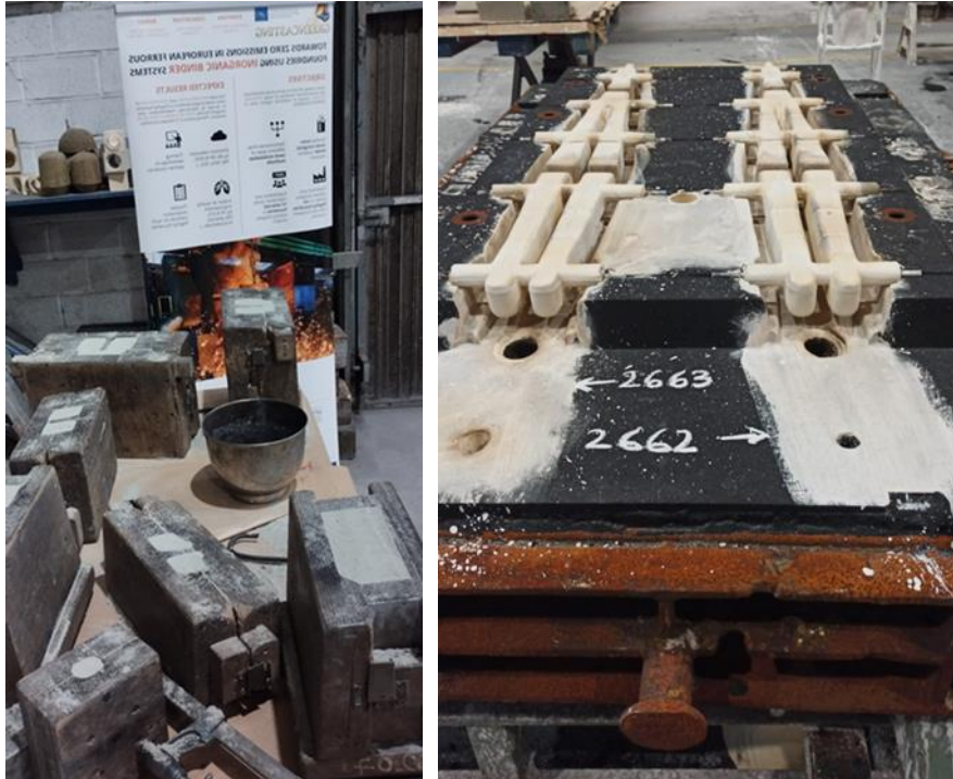
Figure 5-6. Pretests at Voestalpine Railway Systems JEZ foundry in Spain.

METAMSA (Metallurgica Madrilená, S.A.) produces a variety of quality steel castings for Spanish and European customers. They already have experience with inorganic binders, as their molding line for castings weighing more than 80 kg has used a silicate (inorganic) binder system for years. Castings of less than 80 kg are made in green sand line. Metamsa's experiences and knowledge of inorganic binders are shared among the flagship foundries while they try to improve the behaviour of the inorganic line in cooperation with binder manufacturers and other project experts.