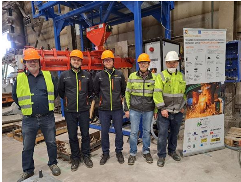
Figure 4. Pretests at Peiron foundry in Finland and the new mixer for the use of inorganic binder.

Peiron is an iron and steel foundry producing parts mainly for the producers of big industrial machines. Maximum casting weight is ca. 5000 kg. Peiron invested a continuous mixer line for the tests with inorganic binders. Peiron has already produced with this mixer ca. 15 tons of moulds and cores by using two no bake type inorganic binders. The casting quality has been comparable with the castings made by their current phenolic Alphaset moulding line.