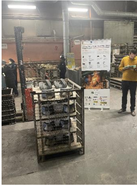
Figure 3. Cores made of inorganic binders at FA Fonderie di Assisi in Italy.

Peiron is an iron and steel foundry producing parts mainly for the producers of big industrial machines. Maximum casting weight is ca. 5000 kg. Peiron invested a continuous mixer line for the tests with inorganic binders. Peiron has already produced with this mixer ca. 15 tons of moulds and cores by using two no bake type inorganic binders. The casting quality has been comparable with the castings made by their current phenolic Alphaset moulding line.