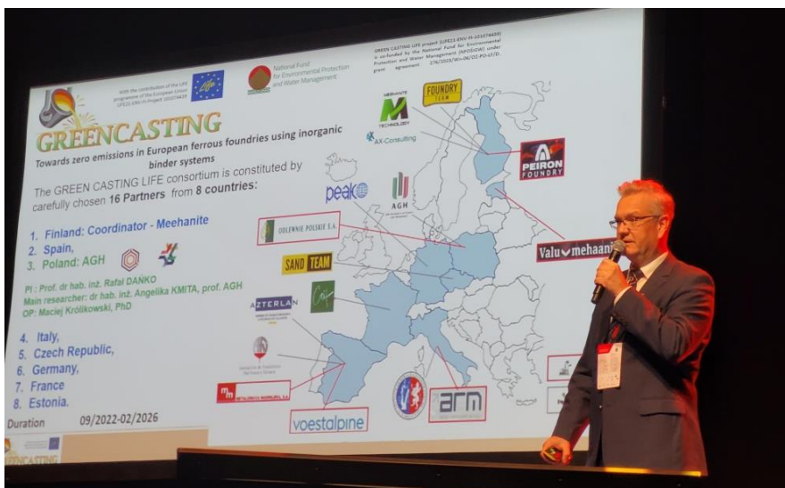
Figure 13-16. Green Casting Panel at IV International Conference of Casting and Materials Engineering ICCME 23 in Krakow, on 6-7.11.2023.

More information about IV International Conference ICCME 23 at: