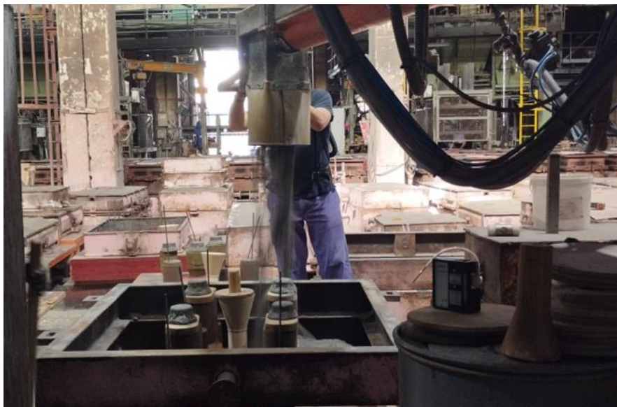
Figure 7. Pretests at metalurgica Madrilená Metamsa foundry in Spain.

METAMSA (Metallurgica Madrilená, S.A.) produces a variety of quality steel castings for Spanish and European customers. They already have experience with inorganic binders, as their molding line for castings weighing more than 80 kg has used a silicate (inorganic) binder system for years. Castings of less than 80 kg are made in green sand line. Metamsa's experiences and knowledge of inorganic binders are shared among the flagship foundries while they try to improve the behaviour of the inorganic line in cooperation with binder manufacturers and other project experts.