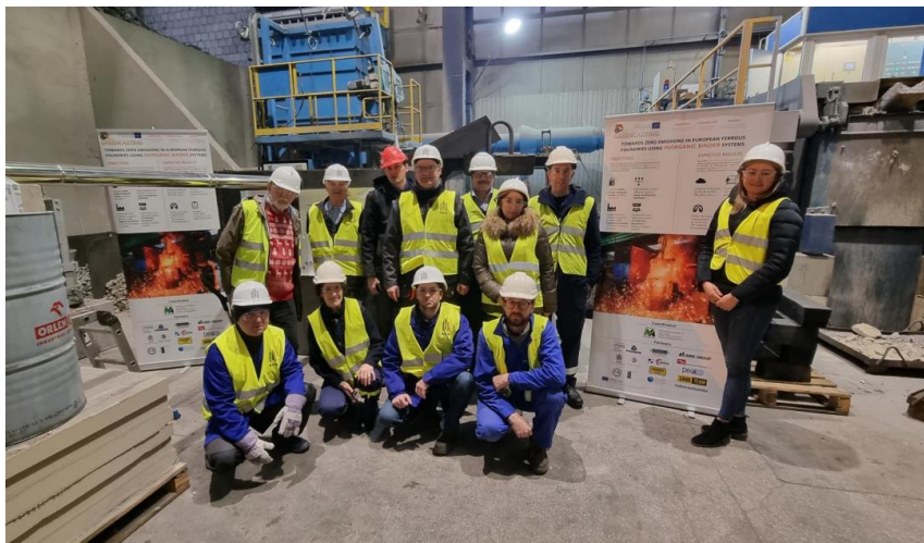
Figure 8. Picture of OPSA foundry.

OPSA (Odlownie Polskie S.A.) is a modern iron foundry applying automatic green sand lines and several core making lines, bot hot-box and cold-box lines. OPSA produces all kind of high-quality iron castings (including ADI) for European customers. Largest market is Germany and main customer groups include eg. machine, automotive, energy and heavy rail industries. OPSA has a phenolic Pep-SET line for smalls series and prototypes. With this line pretests have been started. First has been compared the emissions between organic Pep-set and different inorganic moulds by a chamber test.